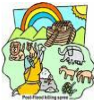
Post-Flood killing spree

Achpa ña chakishka k'ipaga Noéga paibuj warmindij, churigunandij, k'achungunandij jatun barkumunda llujshi- gaguna. Shinaidi tuki animal- guna, sachabi purijkuna, runaguna iñachishkaguna, wairabi purij alisyujkuna, pambada llukusha purijku- nash ishki ishki tandanuku- sha llujshi- gaguna.